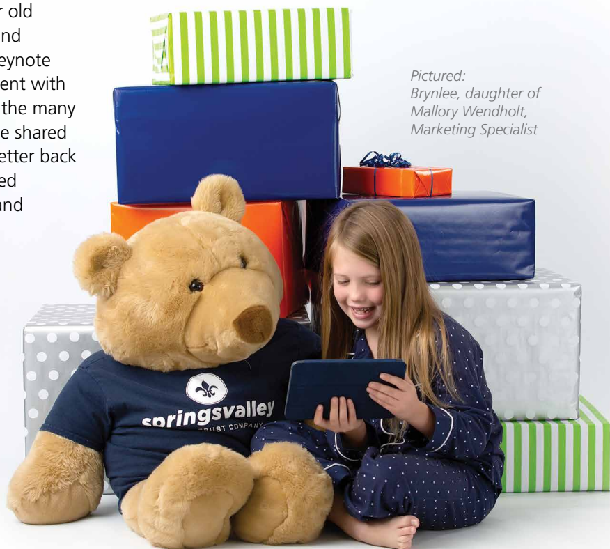
Pictured: Brynlee, daughter of Mallory Wendholt, Marketing Specialist

family unit is under attack, not always due to egregious neglect, but often simply due to our failure to be present!