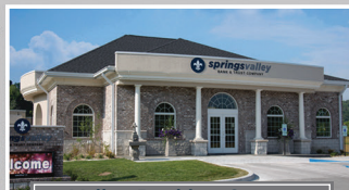
Valley Banking Center 2014