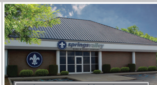
Princeton Banking Center 2020