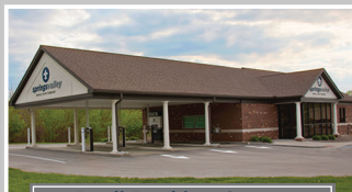
Paoli Banking Center 2015