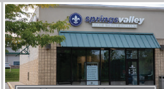
Washington Banking Center 2019