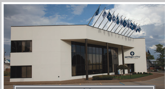
Jasper Banking Center 1986