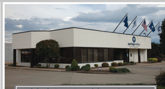
Third Ave Banking Center 1990